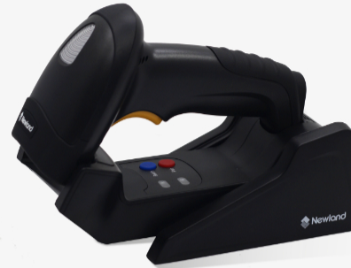
HR32 BT Marlin handheld scanners